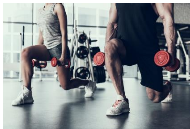
Professional sports management support