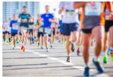
Support for sports competitions and tourist information