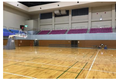
Equipment and machinery for sports facilities