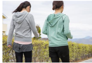
Training wear and sports fashion items