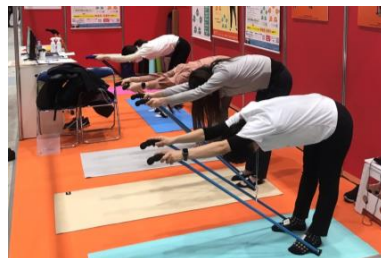
Stretching equipment and health programs