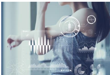
Sports science technology