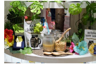
Beauty products and diet foods