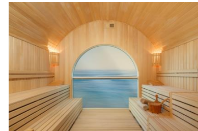
Pool, spa and sauna