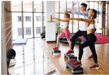
Fitness and training

Products related to sports, fitness, beauty, sports technology, and enhancing sports performance are gathered.