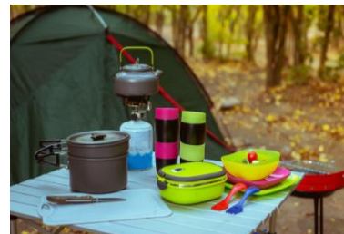
Outdoor equipment and supplies